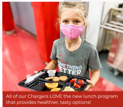
All of our Chargers LOVE the new lunch program that provides healthier, tasty options!