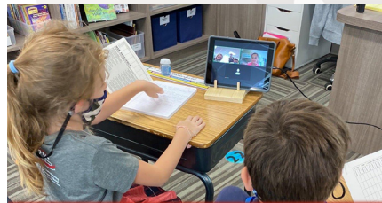
Our Elementary students do group work with classmates who are distance learning.