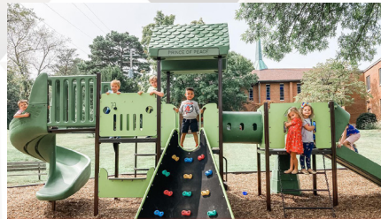
ECE students play on the new playground at our Crestwood Campus.